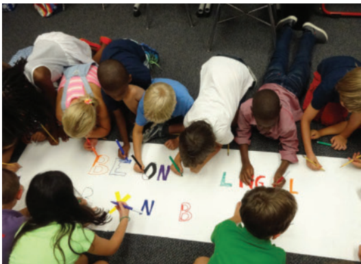
Clockwise, from right: Nalini and Alejandra water the garden at our Lower School; second graders work on and later pose in front of a poster featuring our new tagline.